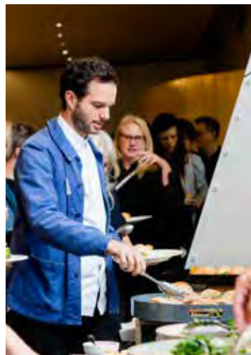
[Image 4] (right) Attendees enjoying lunch at 2019 Conference, Making A Living