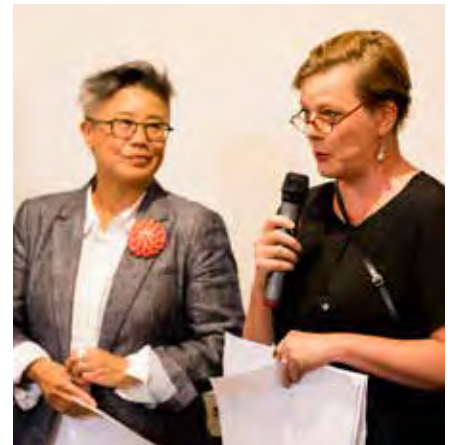
[Image 2] ArchiTeam members at the 2018 Awards opening night