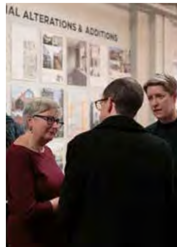
[Image 2] (right) Attendees at the NAM (New Architects Melbourne) event at the 2018 ArchiTeam Awards