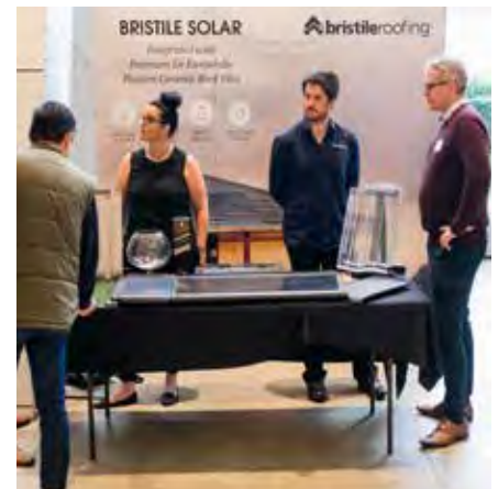
[Image 2] Partners Living Fires at 2019 ArchiTeam Conference - Making A Living

[Image 1] Partners Brickworks setting up their display at 2019 ArchiTeam Conference - Making A Living