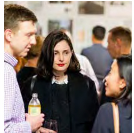
[Image 2] Catering provided by Firecracker